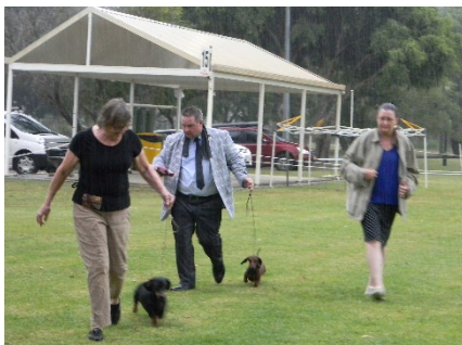
Showing in the pouring rain – Show 2