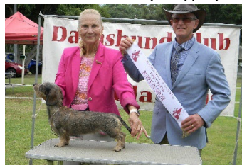
Heidedax Lady Lillypilly