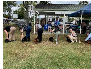
A fine set of rears

A great atmosphere of fun and camaraderie was had on the day, despite the trying weather conditions, and entrants took part in the fun categories of Best Head, Best Front, Best Gait and Best Hindquarters.